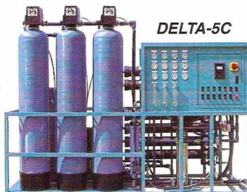
(shown with optional pre-treatment)